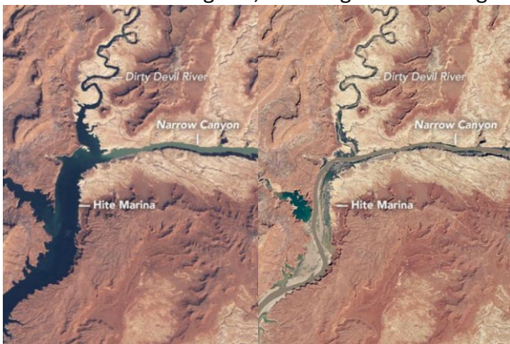
Satellite images from 1997, left, and 2017, right, show the dramatic reduction in water levels along the Colorado River.

In the United States, damming of the Colorado River combined with a 19-year drought may mean that some reservoirs fed by the river will never be full again. The Colorado stretches across the southwest of the country, being a source of water for some of the USA's largest cities such as Los Angeles, San Diego and Las Vegas.