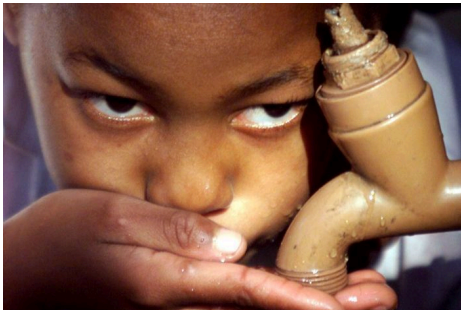
Cape Town was brought to the brink in 2018 as it faced 'Day Zero', where water levels were almost empty.

https://www.abc.net.au/news/2019-03-06/government-places-largest-ever-order-for-desalinated-water/10876760