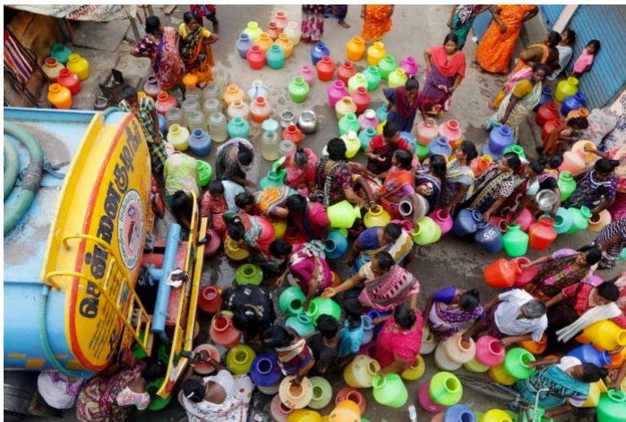
Millions of people are turning to water tank trucks as taps run dry.

The crisis in India's 6 th largest city — with a population bigger than Melbourne and Sydney combined has pushed schools, hotels and commercial establishments to close, while hospitals have put off non-essential surgeries. Millions of people are lining up at water trucks to fill containers of water in a crisis that's hit urban and rural Indians alike, and usually only half leave with their pots filled.